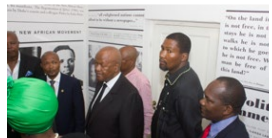
Minister Radebe, Mayor: Cllr Nxumalo and Mandela family visiting Dube Museum during the Memorial lecture.